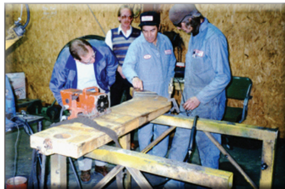
After using Meta-Lax during repair welding of cracks, ripper shank wore out without any further cracking.

Article was Customer Approved Prior to Initial Publication