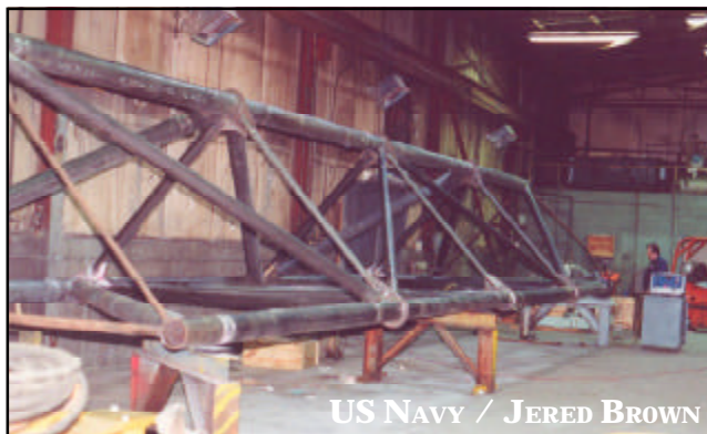
US NAVY / JERED BROWN